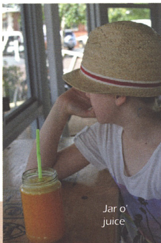
Jar o' juice